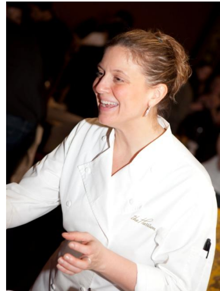
Chef Amanda Freitag of The Harrison 2009 Event