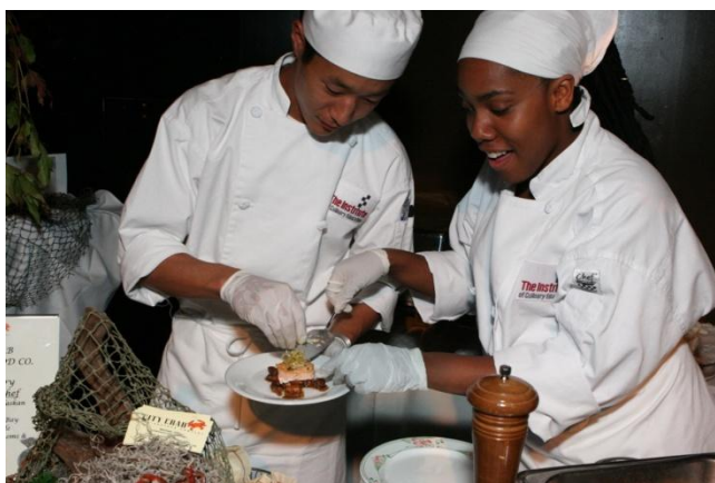
Students of the International of Culinary Education (ICE) at the Fashionable Taste of New York Event